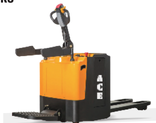
RPT 25 Rider (Capacity 2.5 T)