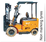
Non marking tyres