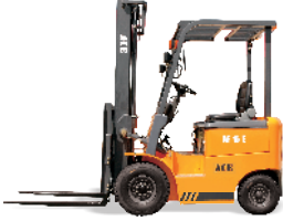
Electric Forklifts (Capacity 1.5 T - 3.0T)