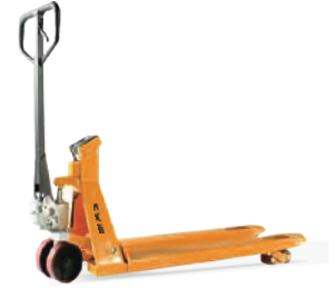
HPT20W Weighing Scale Pallet Truck (Capacity 2.0 T)