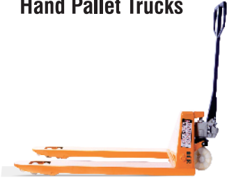
HPT25 N & W Hand Pallet Truck (Capacity 2.5 T)