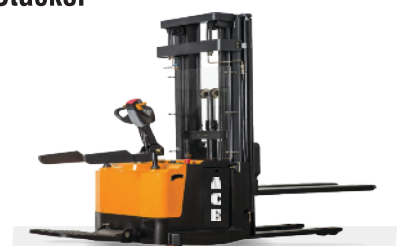
ESS15TWB (Capacity 1.5 T)