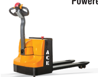
EPT 20 Walkie (Capacity 2 T)