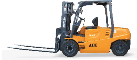
Electric Forklifts (Capacity 4.5T - 6.0T)