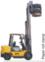
Paper roll clamp