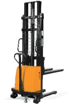
SES15 (Capacity 1.5 T)