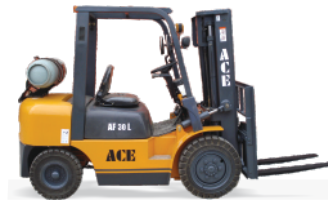
LPG Forklifts (Capacity 3.0 T - 5.0 T)