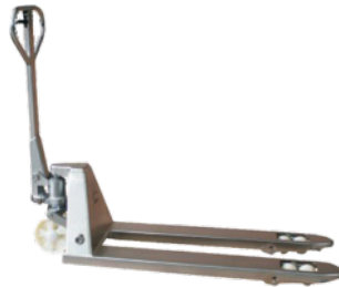
HPT25 SS & G Stainless Steel/Galvanized (Capacity 2.5 T)