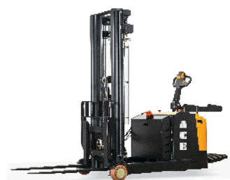
CBES15 (Capacity 1.5 T)