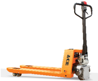
SEPT15 (Capacity 1.5 T)