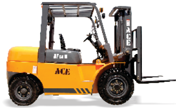
Diesel Forklifts (Capacity 4.0T - 8.0T)