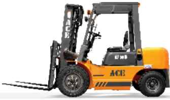
Diesel Forklifts (Capacity 1.5T - 3.0T)