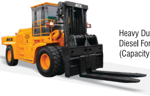
Heavy Duty Diesel Forklifts (Capacity 10T - 35T)