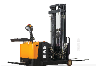
RS15TH (Capacity 1.5 T)