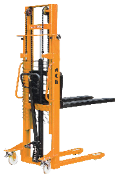
Ms10 (Capacity 1 T)