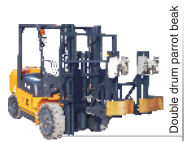
Double drum pallet beak